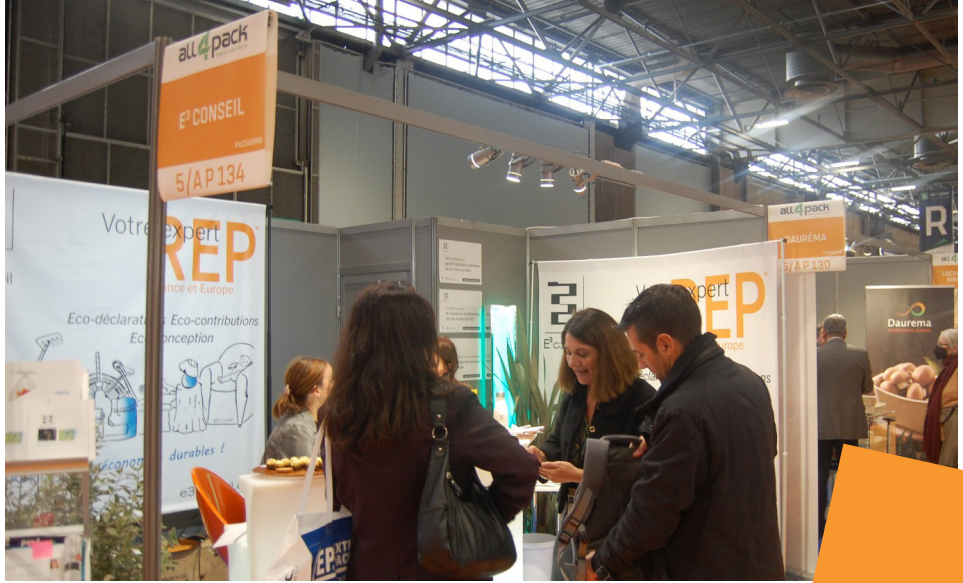
Salon All4Pack, novembre 2022